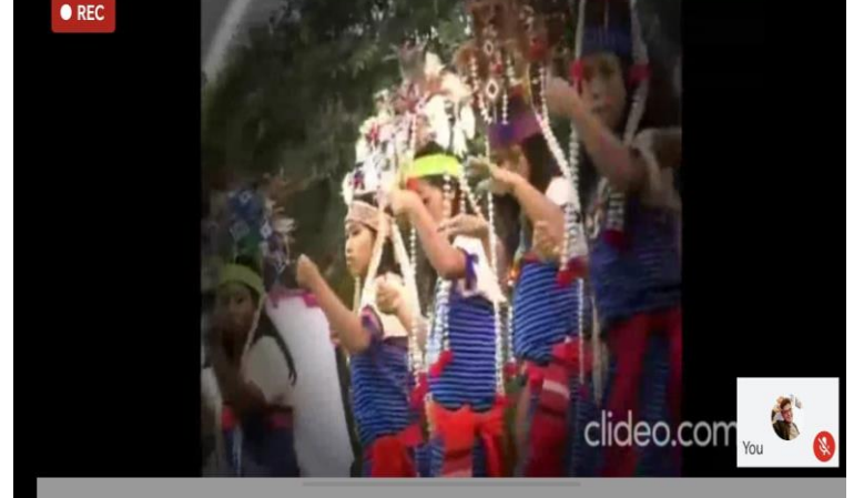
Village tourism at KHONOMA a mountainous village near Kohima in Nagaland